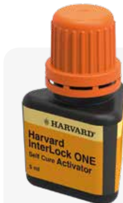
Self Cure Activator