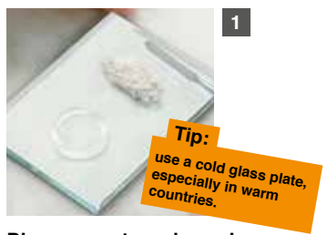
Dispense onto a clean, dry glass plate powder and liquid at approx. 23 °C (73 °F).