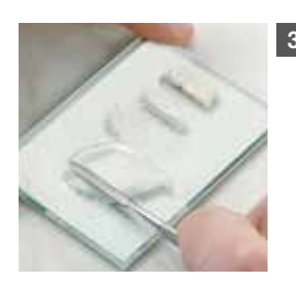
Mixing: start first 1/8 with the whole liquid quartely within 15 seconds.