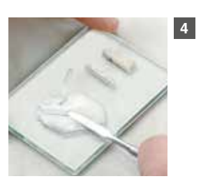
Add second 1/8 and mix for 15 seconds while spreading.