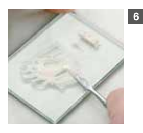
Mix while pressing with flat spatula in the next 30 seconds.