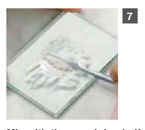
Mix with the remaining half portion for 30 seconds to obtain an homogen mass.