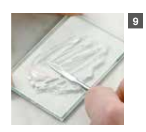
Ready-for-use cement mix within 90 seconds.

Harvard Cement normal setting: For luting consistency: powder 1.5 g, liquid 1.0 g For cavity lining consistency: powder 2.1 g, liquid 1.0 g