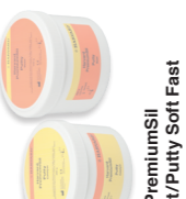
Harvard PremiumSil Putty Soft/Heavy Fast

Harvard PremiumSil/Light/Fast, Medium/Medium Fast, Mono/Mono Fast, Heavy/Heavy Fast