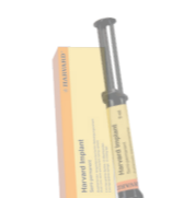
Harvard Implant Semi-Permanent