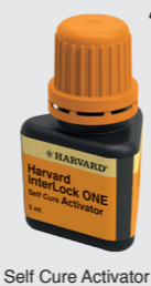
Self Cure Activator