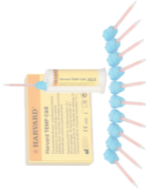
Harvard TEMP C&B