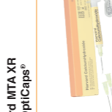
Harvard MTA XR Fast OptiCaps®