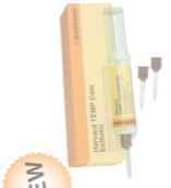
Harvard TEMP Cem Esthetic