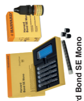
Harvard Bond SE Mono