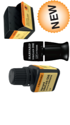
Harvard InterLock® ONE Universal Adhesive