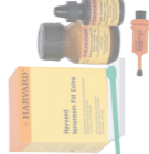
Harvard Ionoresin Fill Extra