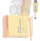
Harvard Ionocoat LC