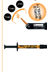
Harvard UltraFill Flow