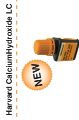
Harvard CalciumHydroxide LC