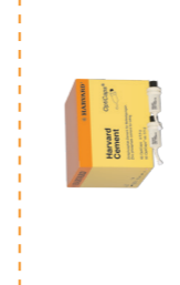
Harvard Cement OptiCaps®