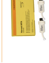
Harvard MTA (Universal) OptiCaps®