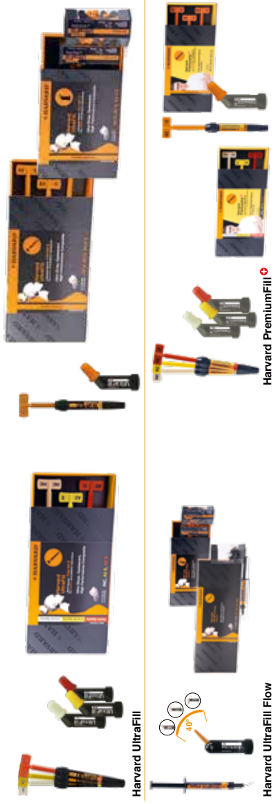
Harvard UltraFill Flow