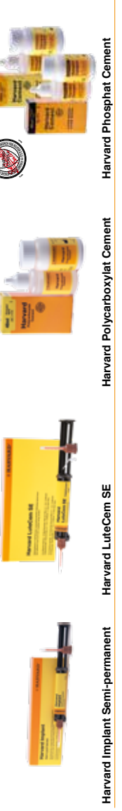
Harvard Implant Semi-permanent