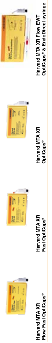
Harvard MTA XR Flow Fast OptiCaps®