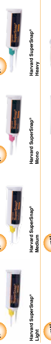
Harvard SuperSnap® Light