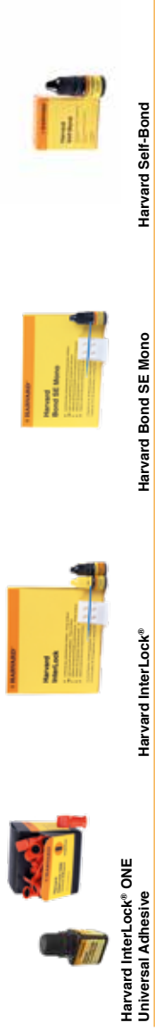
Harvard InterLock® ONE Universal Adhesive