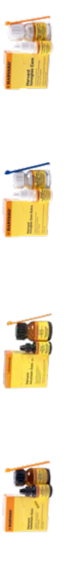
Harvard IonoResin Cem Extra