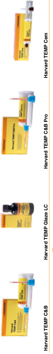
Harvard TEMP C&B