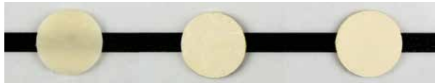
Harvard TEMP Cem Esthetic