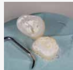
TempBond NE (Kerr)