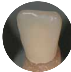
Harvard TEMP Cem