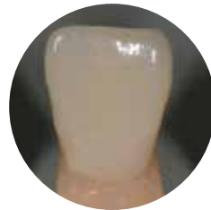
Harvard TEMP Cem Esthetic