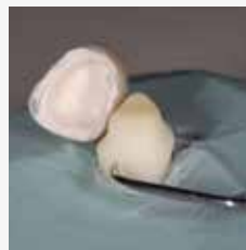
Harvard TEMP Cem