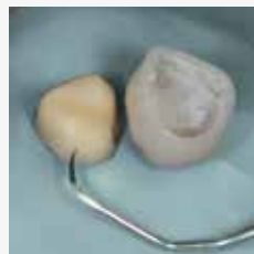
Harvard TEMP Cem Esthetic

Harvard TEMP Cem Esthetic allows an easy removal of crowns and bridges. After removal no residual cement remains on the core.