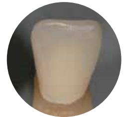
TempBond NE (Kerr)