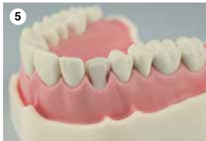
5 Preparation with bevelled enamel