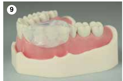
9 Correct repositioning of the filled matrix in the oral cavity