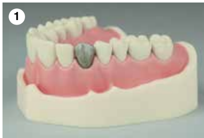
1 Initial situation