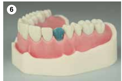
6 Etching of the prepared surface with Harvard Etch