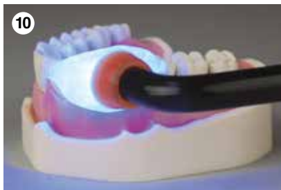
10 40 sec light curing through the matrix. Repeat the process after the removal of the matrix