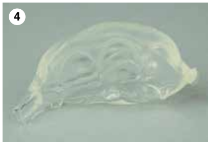
4 Complete matrix