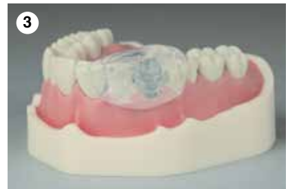
3 Fast setting time (1:20 min. intraoral)