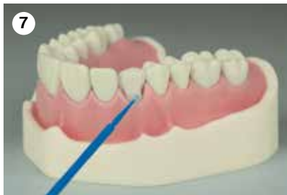
7 Application of an adhesive system, e.g. Harvard InterLock ONE