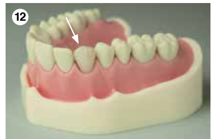
12 Finished direct composite restoration