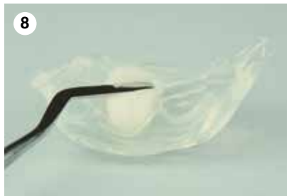
8 Application of a slightly heated packable composite in the matrix, e.g. Harvard UltraFill