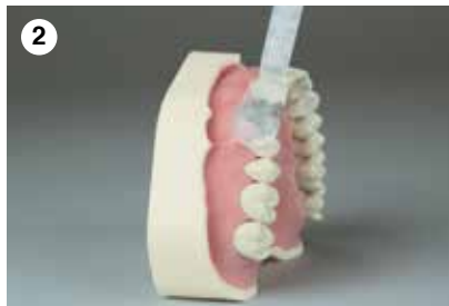
2 Harvard TransMatrix application on the prepared surface and adjacent teeth